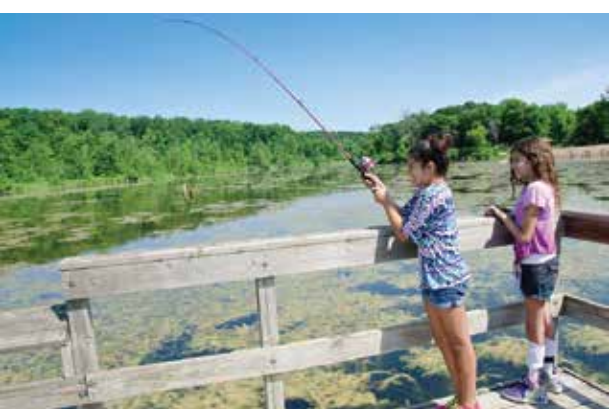
Persons with disabilities may request this information in an alternative format.