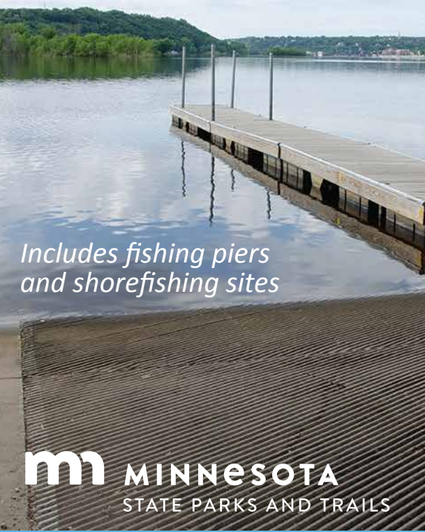
Includes fishing piers and shorefishing sites